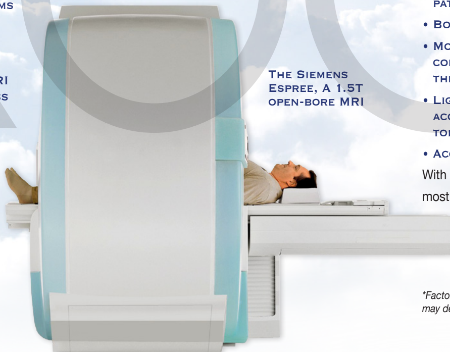
THE SIEMENS ESPREE, A 1.5T OPEN-BORE MRI

Obtain high-field image quality and diagnostic confidence while providing a comfortable scan environment for your patient. Our facility is here to serve you.